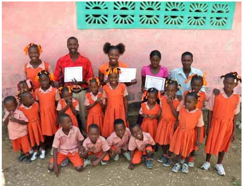
Teachers at Louis Depas Primary school after receiving their 2011 training certificates.