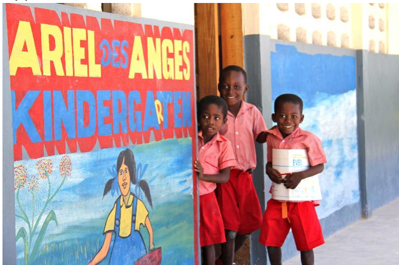
Kindergarten students at Tete L'Etang Primary

During the 2010-11 school year, Hope for Haiti's newly implemented Dawill Bookshare Program equipped 33 Primary schools in Haiti's South with over 27,500 textbooks and notebooks. Additionally, Hope for Haiti's 'Back to School Fund' provided schools with valuable resources such as benches, chalkboards, other essential school supplies.