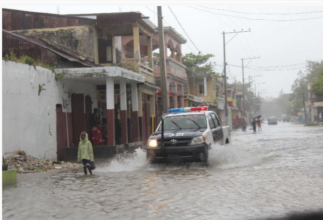
Flooded streets in downtown Les Cayes, Haiti

Just today, we have had 30 new cases of cholera in one of our partner communities due to the flooding overnight. We are grateful to AmeriCares for their quick response in confirming a distribution of cholera medications and supplies to Hope for Haiti in the wake of this storm. We continue to check in with all of our partners and are evaluating their needs and the extent of damage in each community. Once the storm dies down we can begin a safe distribution of survival buckets.