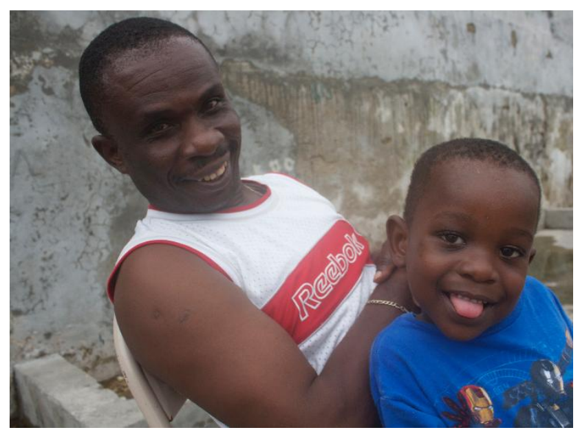
The Director and one of the boys during the 2011 University of Scranton undergraduate mission

Hope for Haiti is celebrating Father's Day with a boys home in Les Cayes, Haiti! Founded in 1980 by the Oblate priests, the facility serves as home for young boys without stable family environments. The home keeps children off the streets and attending school.