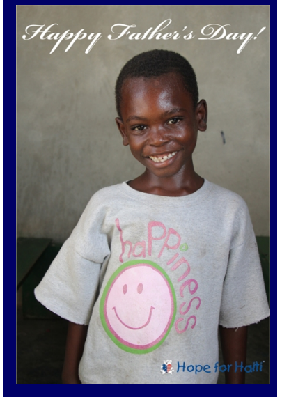
Make a Donation Honor your father and send an eCard for Father's Day!