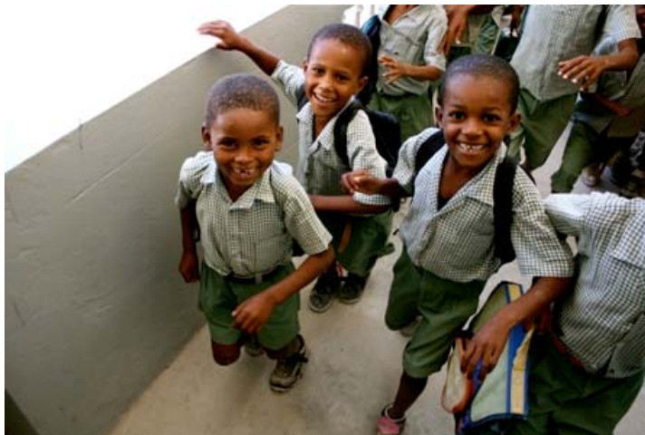
Students head back to school at St. Rose Primary School in the mountain town of Gris Gris.

Save the Date! Annual Gala March 5, 2011