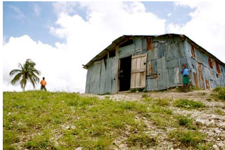
St. Jude of Pereno Primary School, perched on a remote mountaintop but packed with students.

Check out the recent blog posting in the "From the Field" section of our website