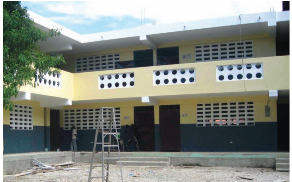
Dominique Savio Secondary School